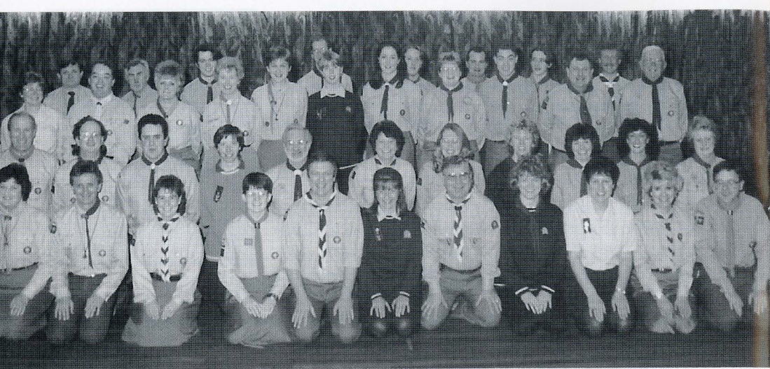
The Senior Gang