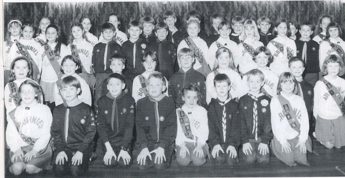
The Cubs and Brownies