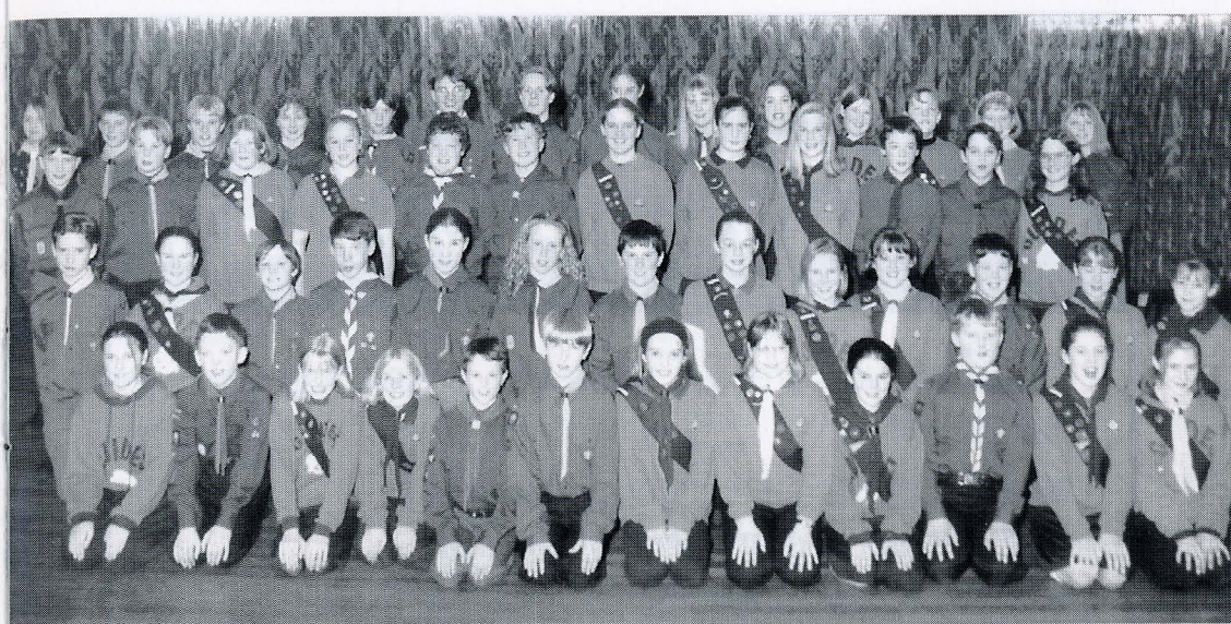
The Junior Gang

Parents, husbands, wives and friends of members of the gang, together with many others who have assisted us in many ways to make this show possible.